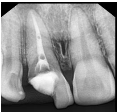
Fig. 5: Calcium hydroxide intracanal medicament in tooth #11;