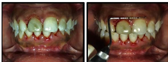
Fig. 12,13: Clinical picture post Laser assisted Crown lengthening to achieve proper contouring of tooth #11;