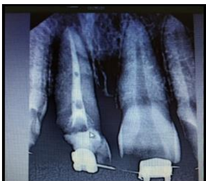
Fig. 9: Radiographic representation of extruded tooth #11.