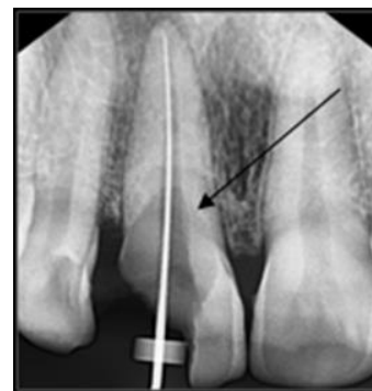
Fig. 4: Radiographic working length determination of tooth #11; fracture line is shown with an arrow;