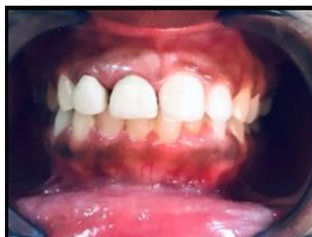
Fig. 14: Post operative clinical picture after PFM crown cementation of tooth #11.