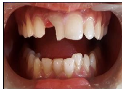
Fig. 1: Clinical picture showing complicated crown fracture in #11;

After 4 weeks, 4 mm of desired extrusion was observed (Fig. 6,7) leading to 0.5 - 1 mm supragingival exposure of fracture margin, which was confirmed radiographically by observing the apex of central incisor which had drifted incisally in the socket (Fig. 9). Further arch stabilization was done for 8 weeks using 17 x 25 stainless steel wire. Finally, after desirable exposure of the fracture margin till gingival level (Fig. 8), the orthodontic brackets were removed after almost three months. Calcium hydroxide was removed from the canal and obturation was done by cold lateral condensation technique which was followed by fiber post and core build-up (Fig.10). Clinically gingival margin of the restored central incisor was found to be unpleasant (Fig. 11). Crown lengthening was done using diode laser to re-contour the gingival margin in relation to the adjacent teeth (Fig. 12, 13). Finally metal ceramic prosthesis was cemented to restore the esthetic need of the patient (Fig. 14).