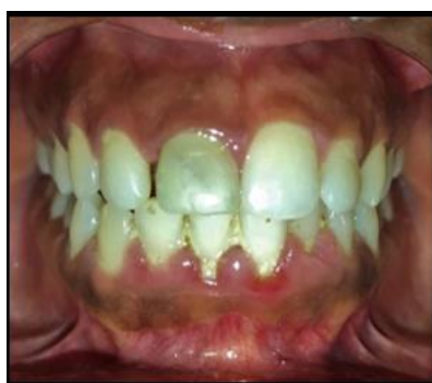
Fig. 11: Clinical picture showing uneven crown margins of tooth #11 after extrusion;