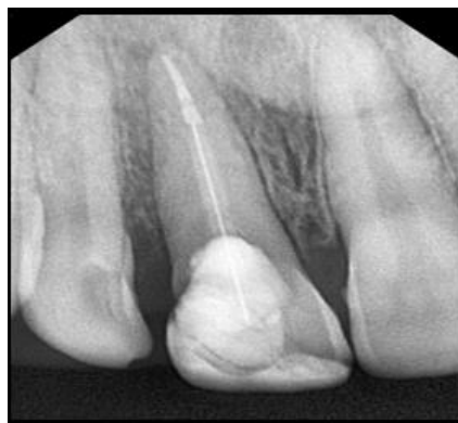
Fig. 10: Radiograph showing obturation followed by fiber post and core build-up of tooth #11;