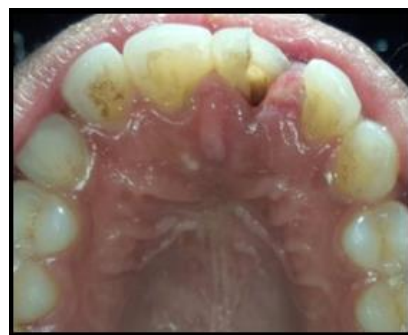
Fig. 2: Clinical picture showing palatal aspect of fractured tooth in #11: