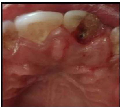
Fig. 8: Palatal aspect of tooth #11 showing fracture margin at gingival level;