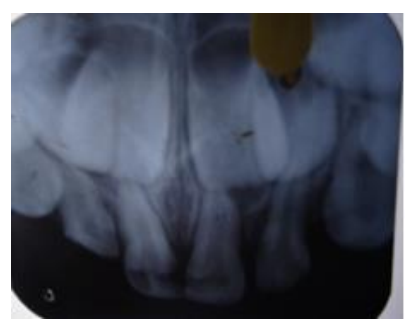
Fig 2: Pre-operative radiograph showing pulpal involvement 51, 52, 61, 62