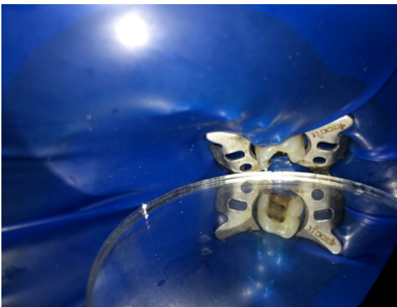
Fig. 2: Picture showing access cavity of #46 with five distinct canal