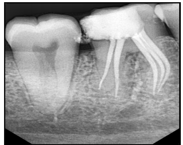
Fig. 5: Post-obturation radiographs showing radix entomolaris & the middle mesial canal