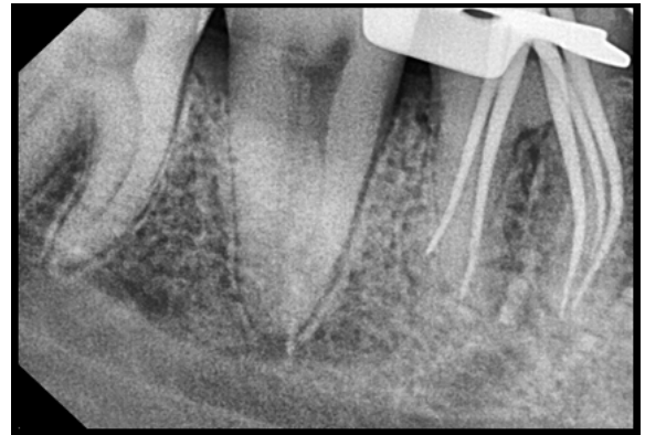
Fig. 4: Master cone radiograph