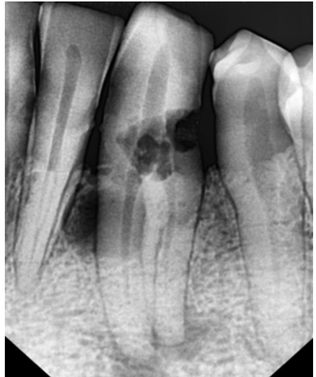
Fig. 1: Diagnostic radiograph showing two separate roots with dental caries and pathology wrt #43.

It is important to recognize the possible permutations of canal morphology in endodontic therapy. Morphologically, permanent mandibular canines are usually mono-radicular in humans. 1 Some atypical findings like, two root canals, one or two roots with three canals; as well as two roots and two canals have been reported. 2,10-13 Heling I et al. reported a case of mandibular canine with two roots and three radicular canals. 14 There is also evidence of even three canals with only two apices, 15 and of two