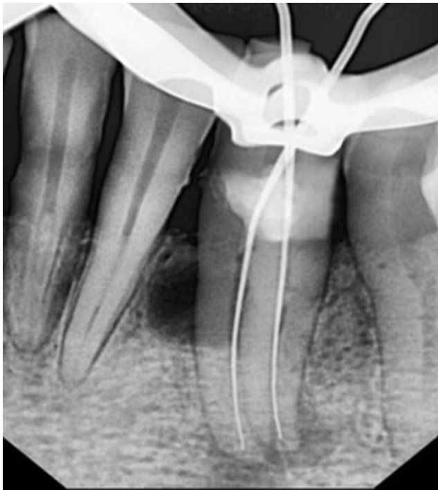
Fig. 3: Working length estimation with k file wrt #43.