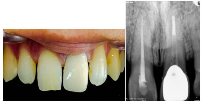
Fig. 3: Postoperative image & radiograph after crown cementation

Restoration of endodontically treated teeth has always been an area of concern and the recent past has witnessed an implosion of interest in the field with regard to functional and esthetic problems. In the wake of changing treatment concepts, the material market for posts has undergone a complete makeover. Ranging from the era of wooden posts to metal posts and more recently, carbon fiber, glass fiber, and ceramic posts, the material and design options are infinite. In the last few years there has been an implosion