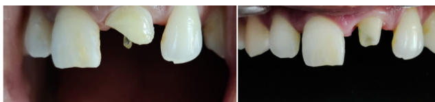
Fig. 2: Fiber post & core build up