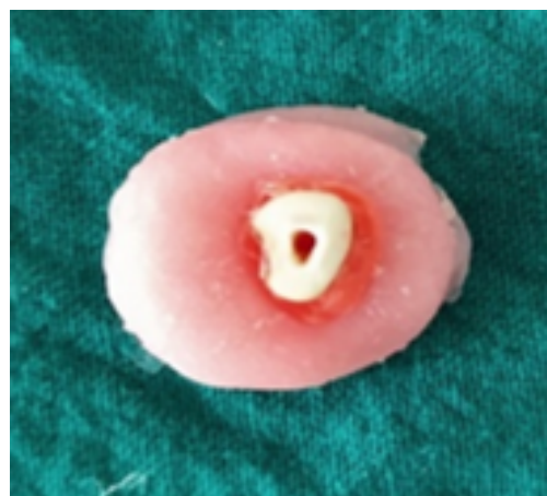
Fig. 2: Sample embedment in acrylic block