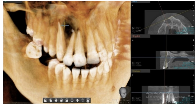
Figure 1: Cystic appearance in CBCT. Sagittal, axial, and coronal view

The lesion was confirmed histologically to be a radicular cyst. It healed uneventfully and is under a follow-up period.