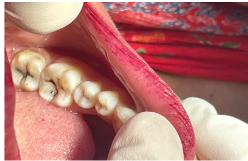
Figure 4: Intraoral photograph of mandibular first left molar showing mimicking maxillary first molar.

In case 2, on intraoral examination, the occlusal surface of tooth 36 had unusual groove pattern. A well-developed oblique ridge was seen extending between Mesiolingual cusp and Distobuccal cusp, giving the tooth occlusal morphology appearance of a maxillary permanent first molar ($).