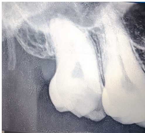
Figure 2: Intraoral radiograph showing permanent maxillary second molar and maxillary third molar