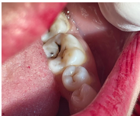
Figure 3: Intraoral photograph of mandibular first left molar showing mimicking maxillary first molar.