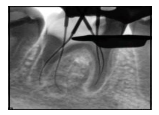
Figure 2: Working length

Access cavity was refined with endo access bur (Dentsply, Switzerland) and calculation of working length with the use of an electronic apex locator of Root ZX, J.Morita was done and was confirmed by radiography. [Figure 2]