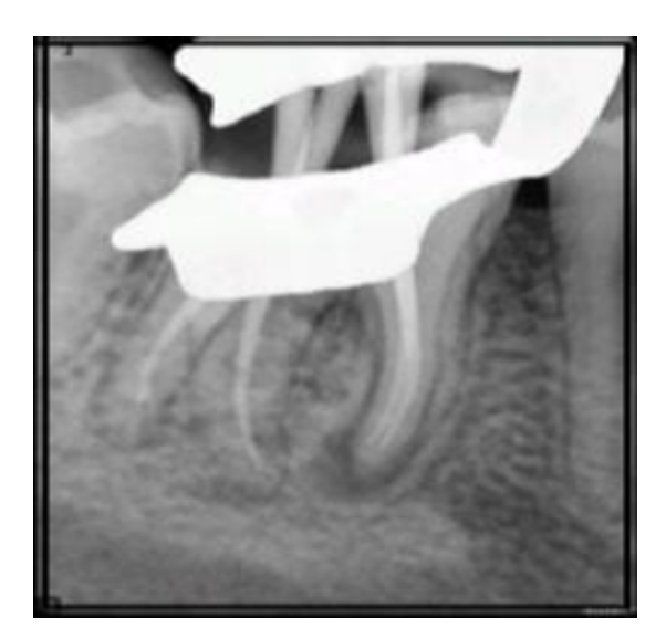
Figure 3: Mastercone

Canals were cleaned and shaped using hand K files and ProTaper Next files (rotary) of Dentsply, Switzerland) with EDTA of concentration as 17%. Irrigation done with sodium hypochlorite 5% and achieved the patency in all the canals which was maintained with a 10#k-file (Mani,