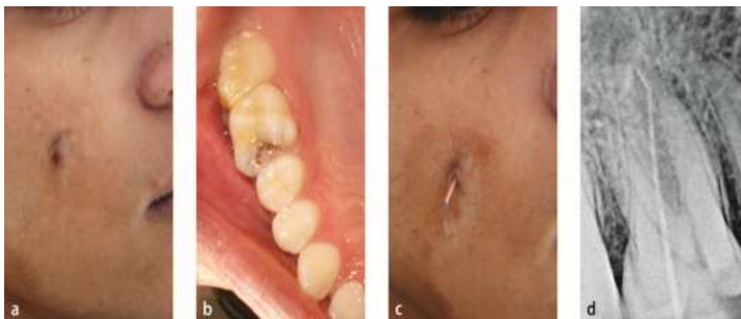
Fig. 1: Pre-operative photographs and radiographs

A 30 no. standard gutta-percha cone was introduced to trace the sinus tract from the cutaneous opening to confirm radio-graphically if the lesion was odontogenic in origin (Fig. 1c). The tract led to the apex of the palatal root of #16 (Fig. 1d).