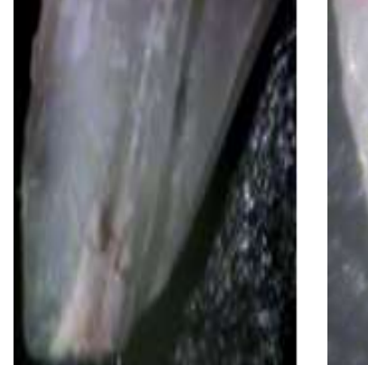
H File (26.83%)