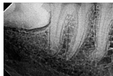
Fig. 3: Intra Oral periapical radiograph showing retrieval of separated instrument

In second appointment, Calcium hydroxide paste was removed using normal saline & Canals were then irrigated with 17% aqueous EDTA solution as a final flush. Root canals were obturated with gutta-percha and AH Plus sealer using warm vertical compaction technique (Fig. 4 & 5). The tooth was subsequently restored. Follow up was done for 6 months and the patient was found to be clinically asymptomatic (Fig. 6).