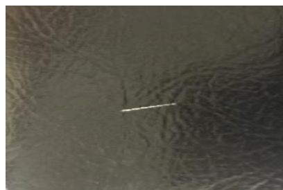
Fig. 2: Magnifying loupes and ultrasonic's which were used and Clinical image of the retrieved broken instrument

In second appointment, Calcium hydroxide paste was removed using normal saline & Canals were then irrigated with 17% aqueous EDTA solution as a final flush. Root canals were obturated with gutta-percha and AH Plus sealer using warm vertical compaction technique (Fig. 4 & 5). The tooth was subsequently restored. Follow up was done for 6 months and the patient was found to be clinically asymptomatic (Fig. 6).