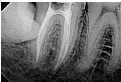
Fig. 5: Intra Oral periapical radiograph showing Obturation