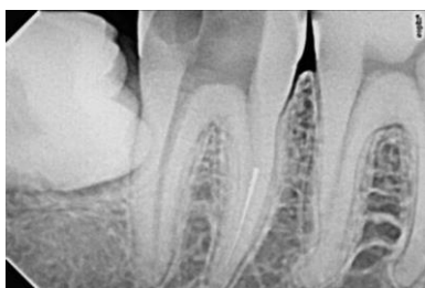
Fig. 1: Preoperative Radiograph showing separated instrument in the middle third of mesiobuccal canal of right mandibular second molar

A 36 year male patient reported to the department of conservative dentistry and endodontics with chief complaint of pain in lower right back region of jaw since 10 days. Patient had started root canal treatment 3 weeks prior at a local dentist. Medical history was non contributory. Intraoral examination revealed incomplete caries removal and incomplete access cavity preparation with mandibular molar. Tenderness on percussion and palpation was positive. Radiograph suggested that separated instrument file in the middle third of the root canal and periapical radiolucency in the distal root (Fig. 1). The case was diagnosed as an incomplete root canal treatment with apical periodontitis in relation to mandibular molar.