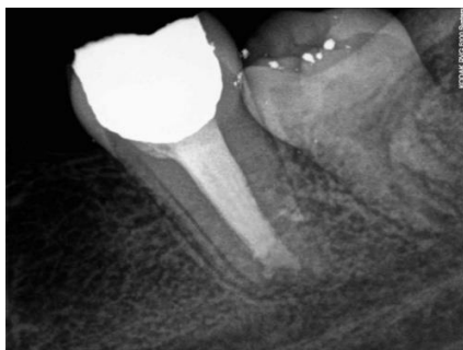
Fig. 6: Follow up radiograph after 6 months