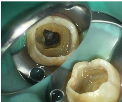
Fig. 1: The pulpal floor observed in first appointment with only one canal with a round or oval orifice was located, suggestive of the presence of a single canal

Endodontic access opening was done under local anaesthesia and rubber dam isolation. On observation of the pulpal floor, only one canal with a round or oval orifice was located, suggestive of the presence of a single canal (Fig. 1). Further exploration of the pulpal floor did not reveal presence of any additional orifice opening. A #15 K-file was introduced into the canal to ensure the patency of the canal and a periapical radiograph was taken to determine the working length. The root canal was enlarged using circumferential filing technique with hand K file up to ISO size 70, under irrigation with copious amounts of 2.5% sodium hypochlorite. The root canal was then dried with sterile paper points. A calcium hydroxide paste (Metapex; Meta Biomed, Chungju, Korea) was placed into the apical portion of canal with a lentulo spiral as intracanal medication. The access cavity was closed with a cotton pellet and glass ionomer cement (Fig. 2). The patient was scheduled for a second visit after 1 week.