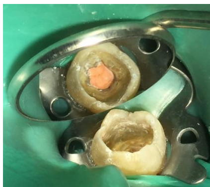
Fig. 5: Obturation of the canal was completed