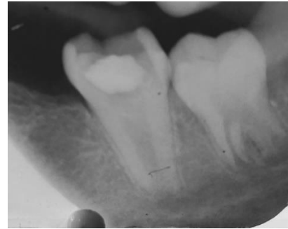
Fig. 2: Radiograph showing open apex and the access cavity closed with a cotton pellet and glass ionomer cement