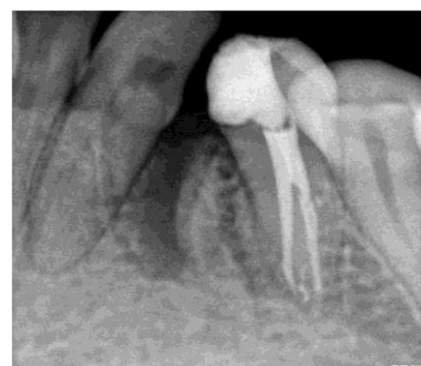
Fig. 2C: Post-obturation radiograph