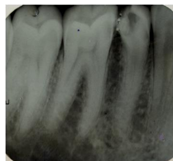
Fig. 1A: Pre-operative diagnostic radiograph

hypochlorite solution and 17% EDTA was used as irrigant alternatively after every instrument change. Apical Preparation was done till F2 size for both the canals, after completion of chemo-mechanical preparation closed dressing was given and patient was reappointed after 3 days for obturation. In follow-up appointment as the tooth was completely asymptomatic master cone radiograph was taken (Fig. 1C). The canals were dried using paper point. Obturation was done using corresponding ProTaper F2 cones; sealapex (Kerr, SybronEndo) was used as a sealer. Radiograph after obturation is taken (Fig. 1D). Post-obturation restoration was done using composite (Filtek Z250, 3M) and post-operative radiograph was taken (Fig. 1E).