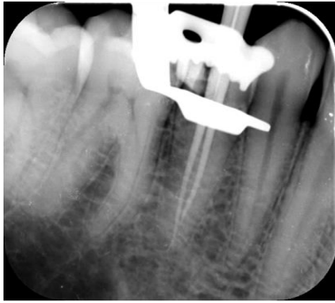
Fig. 1C: Master cone radiograph