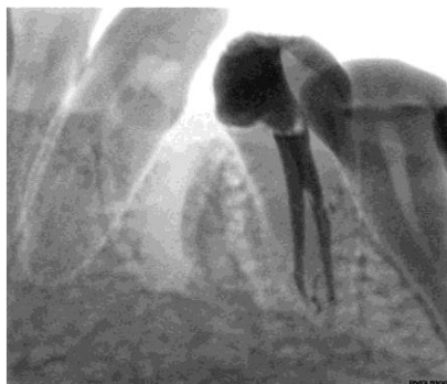
Fig. 2D: Post-obturation restoration negative radiograph