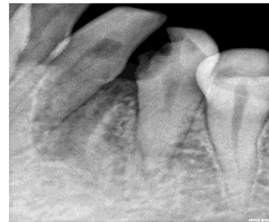
Fig. 2A: Pre-operative diagnostic radiograph

length confirmation (Fig. 2B). After establishing glide path with size 10K and 15K (malleifer) files, both the canals were shaped using ProTaper File system (Dentsply-Maillefer, Ballaigues, Switzerland) with a crown down technique. 5% sodium hypochlorite solution and 17% EDTA was used as irrigant alternatively after every instrument change, recapitulation was done using smaller size file. Apical preparation was done till F2 ProTaper. After biomechanical preparation, closed dressing was given and patient was recalled after 3 days for obturation. In follow-up appointment, tooth was completely asymptomatic, master cone radiograph was taken using F2 Pro Taper Gutta Percha cones. Canal was dried using paper points and obturation was done using sealapex (Kerr, Sybron Endo) as a sealer. Post-obturation restoration was done using composite (Filtek Z250, 3M) and post-operative radiograph was taken (Fig. 2C) and post-obturation restoration negative radiograph (Fig. 2D).