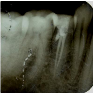
Fig. 1E: Radiograph with post obturation restoration