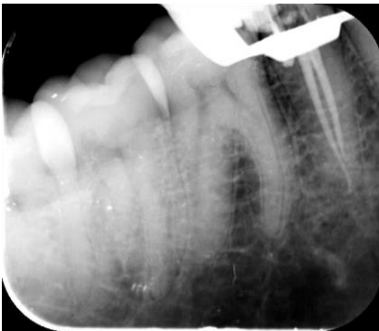
Fig. 1D: Radiograph after obturation