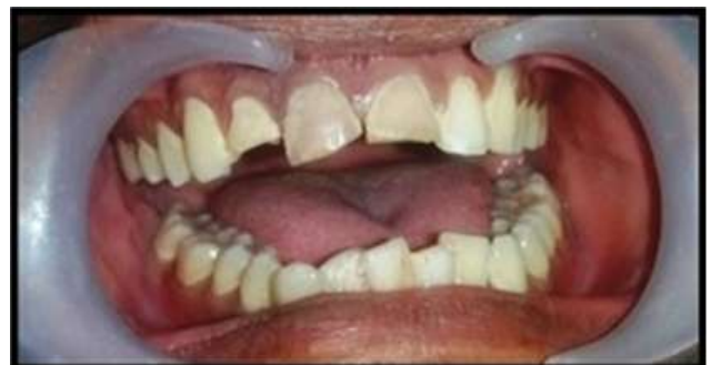
Fig 1: Pre-operative clinical picture

The patient faced two separate road traffic accidents and got trauma affecting the same region of teeth, first one was at the age of 9 years and the second one was 21years. But in both incidences patient did not receive any treatment.