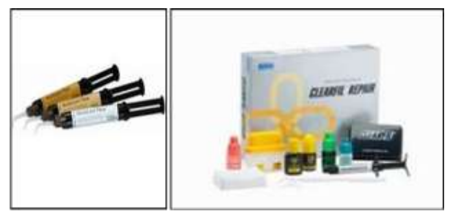
Fig. 2: Multicore Flow; Clearfil Photocore