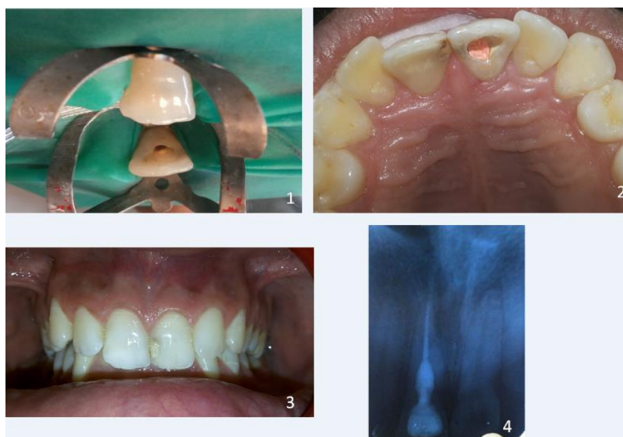
Fig. 2: 1 Access cavity preparation; 2. Post operative palatal view; 3. Post Operative facial view; 4. Post operative radiograph.