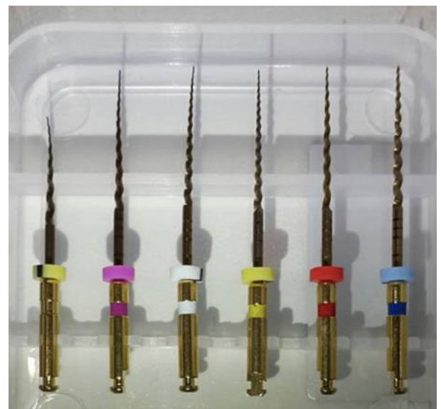
Fig. 1: A total set of V-Taper Gold Files

fatigue test using a stainless steel device produced for and already used in previous studies. The specialized stainless steel block enabled the files to rotate freely within an artificial canal. The plastic top face cover over the apparatus allowed the visibility of the files rotating inside the canal and the removal of broken files during instrumentation. To reduce friction as the metal instrument contacted the metal canal walls, synthetic oil (Wd no:40; USA) was used. The time of fracture for each file was calculated and the data was compared using Mann-Whitney U test to compare two independent groups.