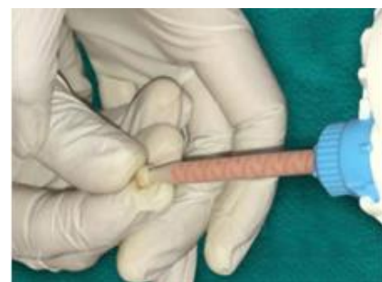
Fig 7: Strip crown filled with Luxa crown material