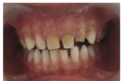
Fig 4: Tooth preparation done 51,61