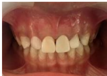
Fig 8: Post-operative photograph showing luxa crowns 51,52,61,62