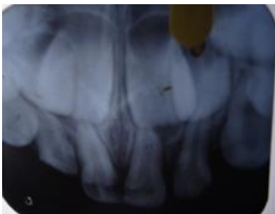
Fig 2: Pre-operative radiograph showing pulpal involvement 51, 52, 61, 62