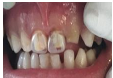
Fig 5: Selection of appropriate-sized strip crowns 51,61