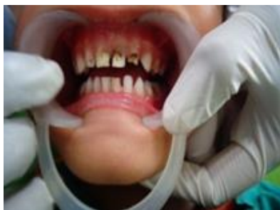
Fig 1: Pre-operative photograph showing carious 51, 52, 61, 62