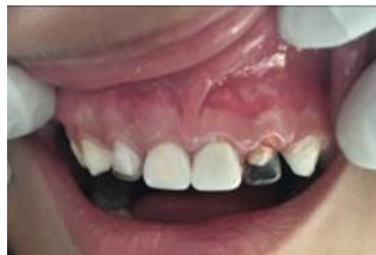
Fig 6: Strip crown adaptation on 52,62