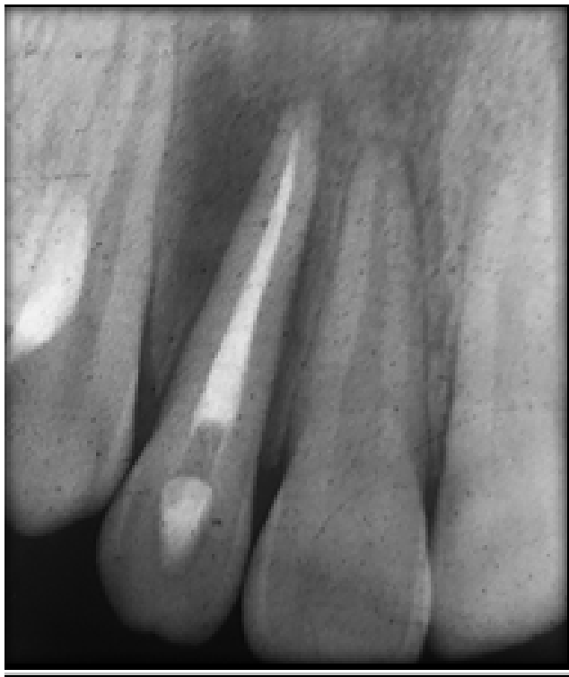
Fig. 4: Immediate post op radiograph

The tooth was then obturated after confirming the canal is dry. Obturation was done with gutta percha cones and zinc oxide eugenol sealer using lateral condensation technique, sealing the cavity with a temporary filling material which was later replaced by composite resin filling material. Patient stayed asymptomatic during post-treatment recalls. 3 months and 6 months post treatment radiographic follow up uncovered practically complete goals of endodontic treatment with nearly complete involution of periapical radiolucency.