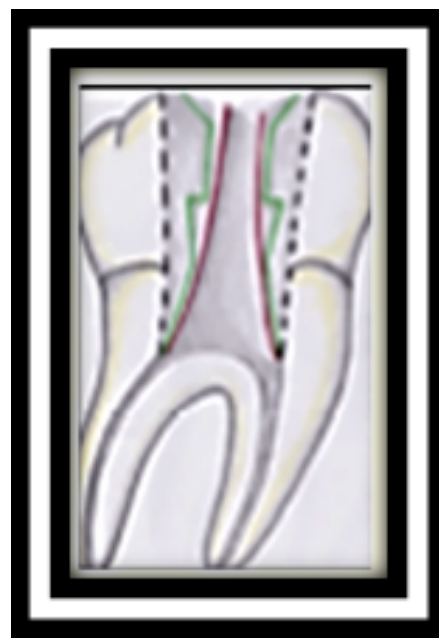
Fig. 1: Black line shows traditional access cavity VS green line shows contracted access cavityvs red line shows ninja access cavity. 8

The outline of the cavity is based on its name a ‘Ninja’, wherein there is an oblique projection headed in direction of the central fossa of the root orifices in an occlusal plane. It runs in a line which is parallel in direction with enamel cut of 90° or more in regard to the occlusal plane, providing better visualization of the root canal orifices when seen from capricious angulations. 6,8,10