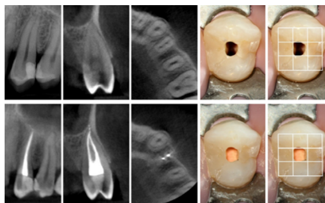
Fig. 2: Contracted Access Cavity along with CBCTsuperimposition 9