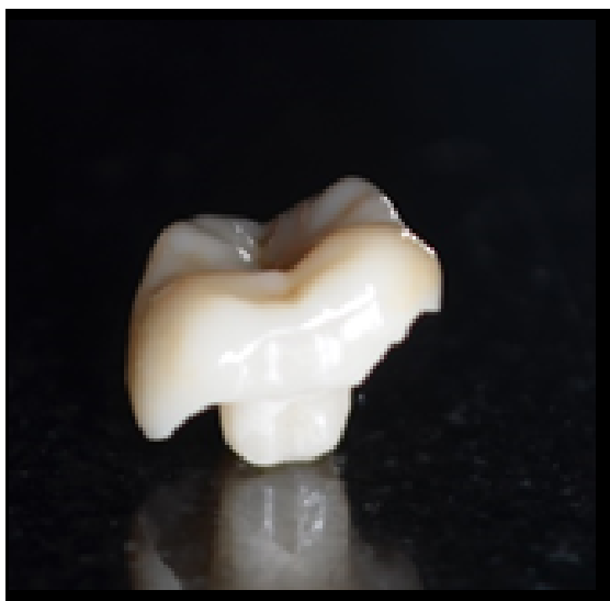
Fig. 2: Customized zirconium restoration

easy fabrication b) Scanning of intra oral tissues takes less time than conventional impression c) if chair side system is available, patients can get their restorations in one appointment.