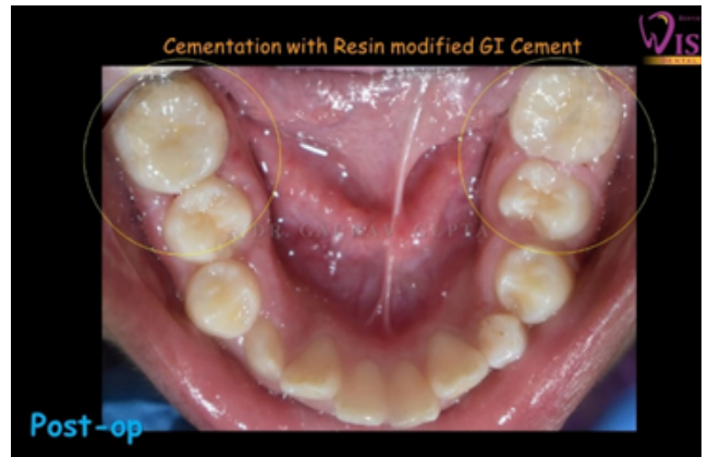
Fig. 6: Cementation with Resin modified GIC