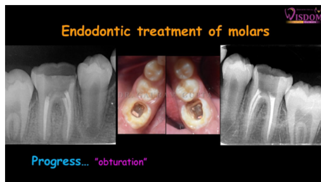
Fig. 2: RCT done in left and right side mandibular 1 st molar

hypochlorite and 17% was used as irrigants at every change of instrument. The apical preparation was done. Calcium hydroxide was placed as an intracanal medicament and obturation done using RH Fill sealer.(Figure 2)