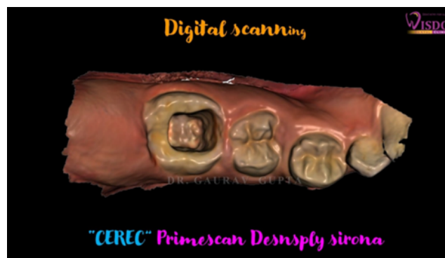
Fig. 3: Intraoral scan

Scanning was done by intraoral scanner (Dentsply Sirona Omnicam) after minimal tooth preparation only occlusal to capture a digital impression for further processing in CEREC software (Figure 3). A Digital record of the segment with opposing arch was also recorded. Scanning provides easier, more intuitive, and precise 3D models in natural colours in less than 2 minutes.