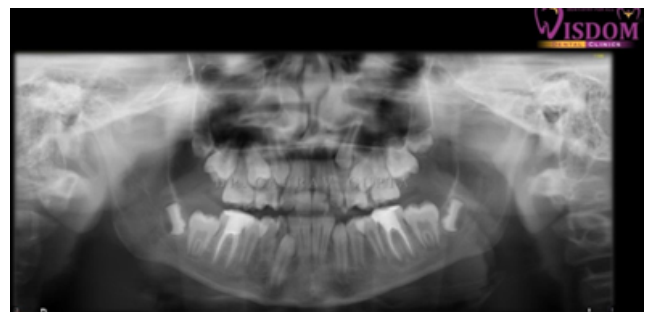
Fig. 7: Post-operative OPG

Fitting, aesthetics, and characterization were checked in the patient’s mouth. Then, the tooth was cleaned and prepared for luting with resin modified GI cement. Excess cement was removed from interdental spaces and occlusion was checked. The patient was given post-operative instruction.[Figures 6 and 7]