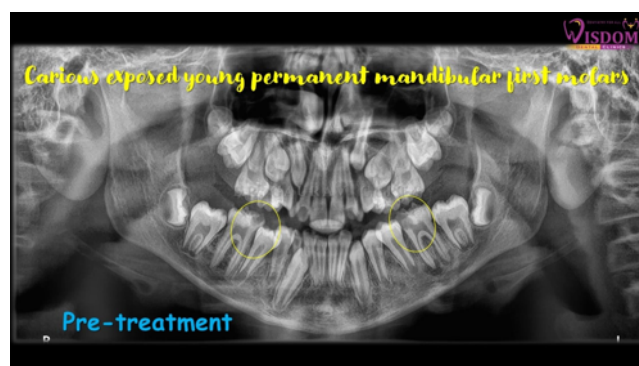
Fig. 1: Pre-operative OPG

A 10-year-old boy came to clinic with decayed tooth and pain in mandibular left and right permanent back region. A medical, as well as clinical history, was taken along with the radiographic examination, which showed the presence of deep dentinal caries with pulpal exposure and extensive loss of tooth structure in the right and left young permanent mandibular 1 st molar. The tooth was found to be tender on percussion. (Figure 1)