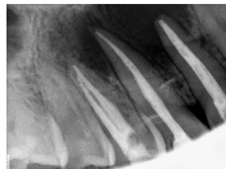
Fig. 3: Immediate Post-Op (12,13,14)

On the fourth visit, tenderness on percussion, mobility and the intraoral swelling was assessed. All pre-op signs and symptoms had regressed, following which master cone selection and obturation was done using Ceraseal (Meta Biomed) as sealer using the single cone technique. (Figure 3) The patient was recalled after 2, 6 and 12 months for evaluation. Healing of the periapical lesion radiographically was seen with reduction in mobility.