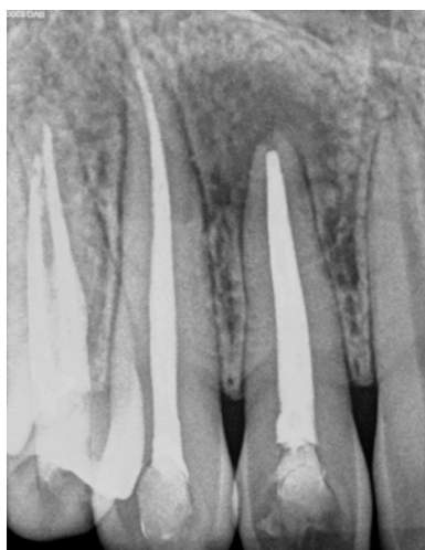
Fig. 5: 12 Months follow up (12,13,14)