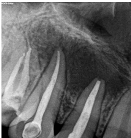
Fig. 4: 6 Months follow up (12,13,14)