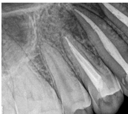
Fig. 6: 12 Months follow up (13,14)