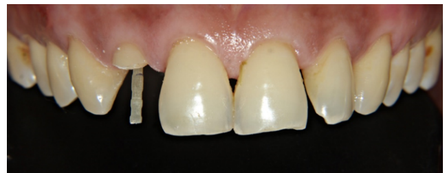
Fig. 8: Cementation of Fiber post