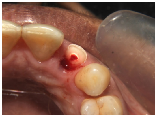
Fig. 3: Atraumatic extraction of tooth #12.

The crown fragment of the tooth was atraumatically removed under local anaesthesia and stored in normal saline until reattached. (Figures 3 and 4) Traumatic pulpal exposure was refined for straight line access using a long-tapered fissure TF-12 bur (Mani Inc, Japan). Working length was determined using the Apex locator (AI Endomotor, Guilin Woodpecker Medical Instrument Co Ltd) and confirmed using an intraoral periapical radiograph (IOPA) (Figure 5). Biomechanical preparation was done using hand files (Mani Inc, Japan) with 5.25% sodium hypochlorite and saline irrigation. Tooth # 12 was obturated using the Sectional (Chicago) technique with Touch and heat (Sybron Endo) (Figure 6).