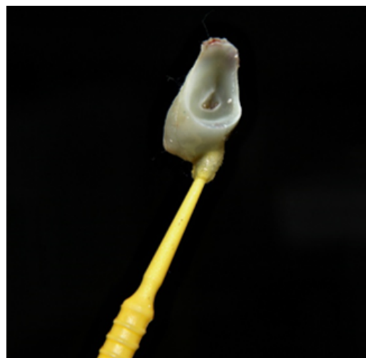
Fig. 4: Tooth fragment.