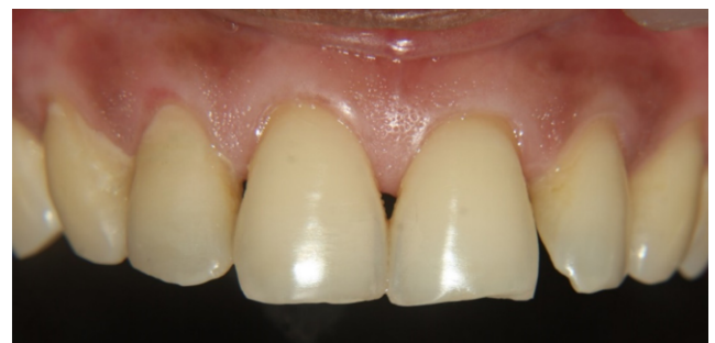
Fig. 9: Photograph of a 6-month follow-up labial view