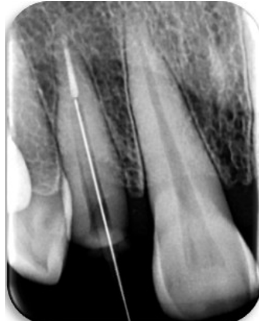
Fig. 7: Fiber post seating verification