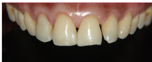
Fig. 11: Photograph of a 1-year follow-up labial view.