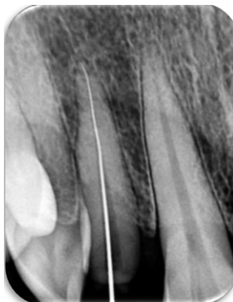
Fig. 5: Working length radiograph of tooth #12