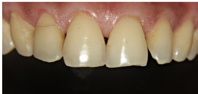
Fig. 1: Preoperative labial photograph demonstrating a fracture with tooth # 12.

(Figure 2). Considering various treatment modalities, the minimally invasive approach of fragment reattachment was chosen as the line of management.