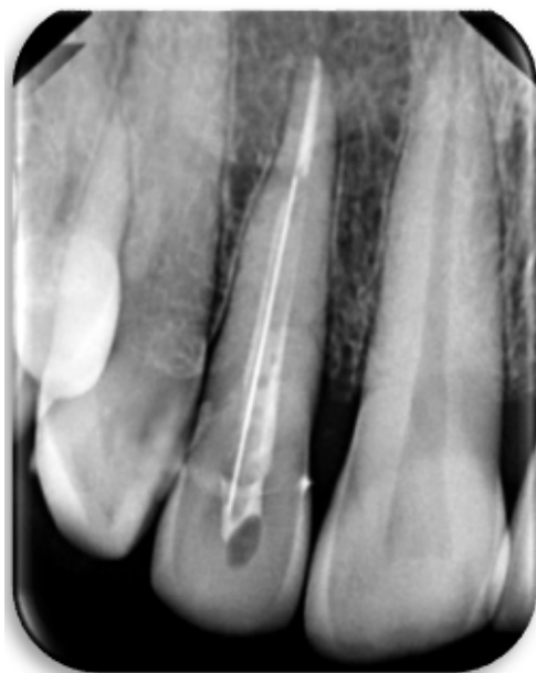
Fig. 10: Six-month follow-up radiograph