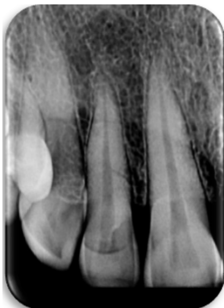
Fig. 2: Preoperative radiograph of tooth #12 fracture.

The crown fragment of the tooth was atraumatically removed under local anaesthesia and stored in normal saline until reattached. (Figures 3 and 4) Traumatic pulpal exposure was refined for straight line access using a long-tapered fissure TF-12 bur (Mani Inc, Japan). Working length was determined using the Apex locator (AI Endomotor, Guilin Woodpecker Medical Instrument Co Ltd) and confirmed using an intraoral periapical radiograph (IOPA) (Figure 5). Biomechanical preparation was done using hand files (Mani Inc, Japan) with 5.25% sodium hypochlorite and saline irrigation. Tooth # 12 was obturated using the Sectional (Chicago) technique with Touch and heat (Sybron Endo) (Figure 6).