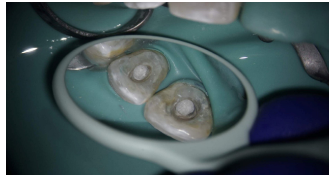
Fig. 4: Placement of Glass Ionomer Cement as barrier