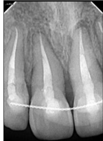
Fig. 3: Intraoral radiograph showing obturated maxillary incisors

Orthodontic retreatment and retreatment of #11, #12 followed by intracoronal bleaching was planned. After completion of orthodontic treatment, we started with endodontic treatment. #11, #12 were isolated with rubber dam. Gutta percha was removed. Biomechanical preparation of canals was done with Protaper next F2. Canals were irrigated with saline and sodium hypochlorite while