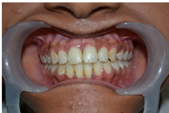
Fig. 6: Photograph showing bleached maxillary incisors

preparation. Canals were dried with absorbent points and obturated with corresponding gutta percha Figure 3. Cavity was sealed with Coltisol F (Coltene Whaledent, Alstatten, Switzerland).