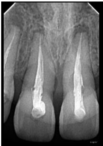
Fig. 2: Intraoral radiograph showing root canal treated maxillary incisors

Orthodontic retreatment and retreatment of #11, #12 followed by intracoronal bleaching was planned. After completion of orthodontic treatment, we started with endodontic treatment. #11, #12 were isolated with rubber dam. Gutta percha was removed. Biomechanical preparation of canals was done with Protaper next F2. Canals were irrigated with saline and sodium hypochlorite while