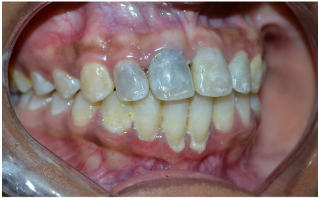
Fig. 1: Preoperative Intraoral photograph showing discolored maxillary incisors

A 35yrs old female presented with chief complain of discoloured upper anterior teeth. Patient gave history of orthodontic treatment 5yrs ago and root canal treatment of maxillary incisors. On intraoral examination, tooth #11, #12 found black discoloration and #21, #22 mildly discoloured Figure 1. Intraoral radiograph revealed #11, #21, #22, #12 was root canal treated Figure 2. Patient was dissatisfied from her orthodontic treatment also. A treatment plan was made and discussed with her.