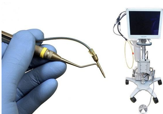
Fig. 1: Perioscope

This endoscope for dental puposes is manufactured by dental view inc., lake forest CA, USA (Figure 1).