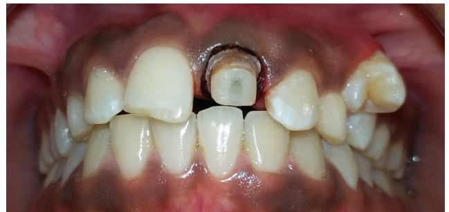
Fig. 7: Gingival retraction cord was placed prior to impression.