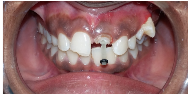
Fig. 5: Glass fiber post was cemented inside the canal using resin cement.

Teeth with open apices and incomplete root formation require a separate treatment plan. To treat such teeth an apical barrier is required to limit the obturating material and avoiding the extrusion into the periapical tissues. Calcium hydroxide has been used for the treatment of nonvital teeth with open apices to form artificial barrier. 6 But due to the time required for apexification with it which ranges from