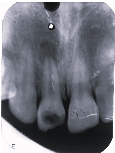
Fig. 1: Pre-operative radiograph showing open apex with a periapical lesion with respect to 21.

A 21-year-old female patient reported with the chief complaint of an unesthetic smile. The patient gave history of trauma to the front teeth region 10-11 years back. Clinical examination revealed fractured left central incisor involving enamel, dentin and pulpal space. There was no tenderness on vertical percussion plus no intra oral abnormalities. Intra oral periapical radiograph showed exposed root canal system with an open apex and a peri-apical lesion (Figure 1). Pulp vitality tests were negative for both thermal (cold) and electric pulp testing (Waldent, Inc.). Hence, diagnosis of asymptomatic apical abscess with an immature root apex was established with respect to 21.