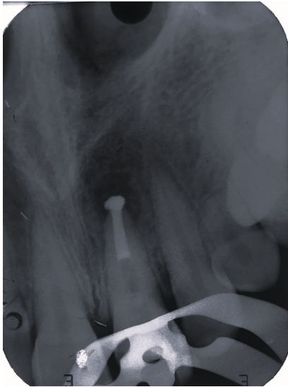
Fig. 4: MTA placed in the apical 4-5mm of the canal to form an apical barrier.

In the third visit, hand files and pluggers were used to confirm the formation of the apical plug. After confirming the closure of the apex, the undermined coronal structure was removed to evaluate the remaining coronal structure. As the remaining coronal tooth structure was poor, it was decided to restore the tooth with a fiber post and a composite core for better strength and retention of the final prosthesis. A Glass Fiber post (RelyX, 3M ESPE) was cemented inside the canal using RelyX U200 (3M ESPE) resin cement (Figure 5). After curing the cement, extra cement was removed and a layer of Universal adhesive (3M ESPE) was applied on to the remaining post and tooth surface. For the core, Bulk fill Composite (3M ESPE) was used (Figure 6). Finally tooth preparation was done for porcelain fused to metal crown as preferred by the patient. Gingival retraction cord (Prime Dental Products Pvt.Ltd.) was placed prior to impression (Figure 7). Impression was made using putty and light body (GC India) impression technique. Shade selection was done using Vita Classic shade guide (VITA Zahnfabrik).