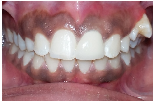
Fig. 8: Final outcome after cementation of Porcelain fused to metal crown.