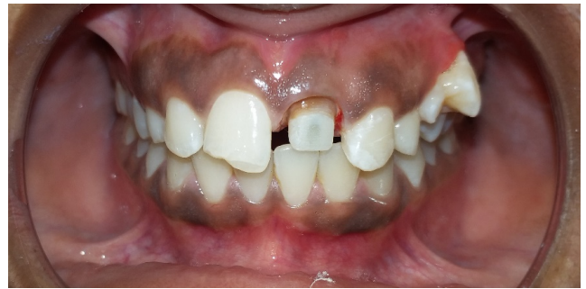
Fig. 6: Core build up was done using Bulk fill Composite.