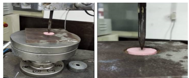
Figure 2: Custom made jig and plunger tip