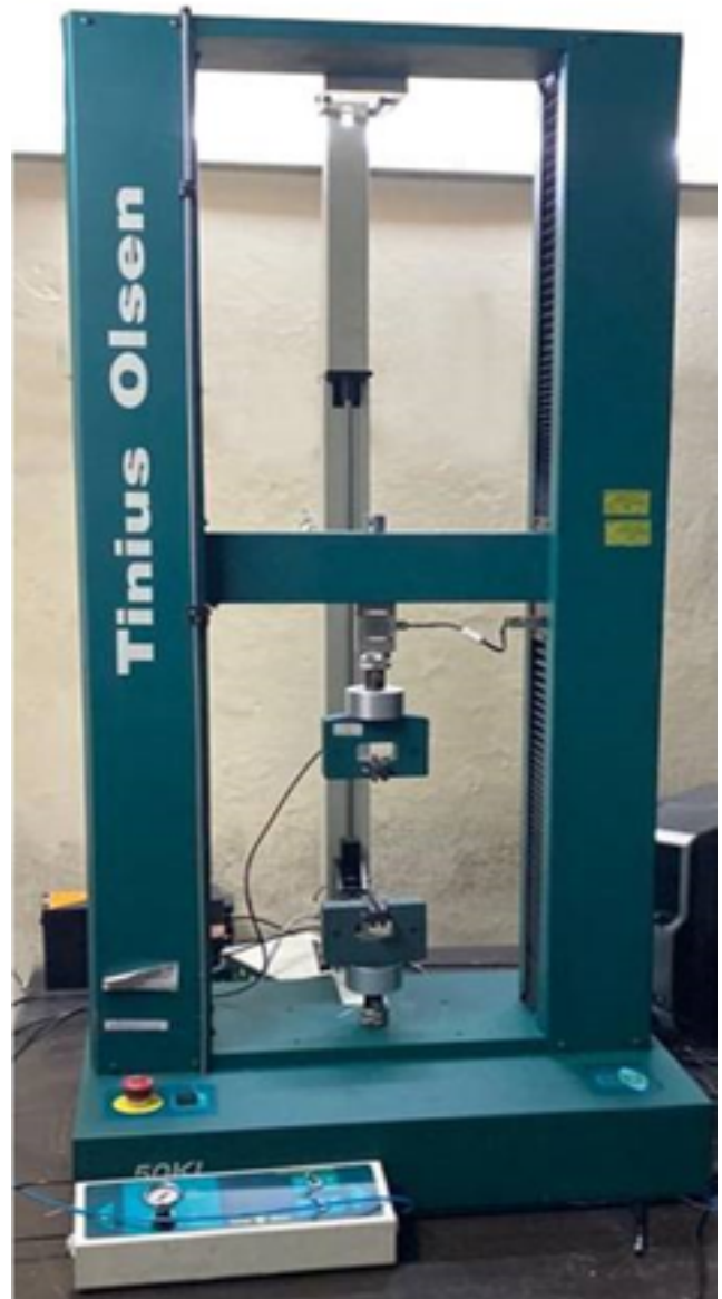
Figure 1: Universal testing machine

Ricucci D et al observed that ramifications occurred most commonly in apical one third of root in posterior teeth. It was found that in 73.5% cases, ramifications were observed in apical part, 11% in middle third and 15% in coronal third of root. 10 As in the middle one third of root, presence of accessory or lateral canals were less as compared to coronal