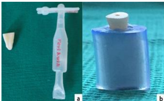
Fig. 1: a – Tooth apex sealed with cyanoacrylate glue; b – Specimen mounted in putty impression material to mimic closed root canal system

decoronated below the CEJ to obtain uniform length (10 mm). The apices of all the specimens were coated with cyanoacrylate glue; after which they were embedded in putty impression material to simulate the closed apical system (Fig. 1).