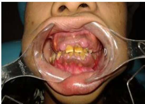
Fig. 1: Extra oral Preoperative photograph

In Phase 3 to improve aesthetics and to establish anterior tooth function acrylic crowns were given on anterior teeth as a part of temporization. As there was insufficient tooth structure and further reduction of tooth would lead to pulpal exposure. This will be later replaced by Porcelain Fused to Metal crown once the growth spurt is completed. Occlusal surface of premolars and 2 permanent molar were restored. Oral hygiene instructions were given and the patient was recalled after 1 month for follow up. After a follow up of 6 months the patient was satisfied with both function and aesthetics.