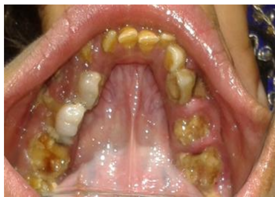
Fig. 3: Preoperative Intraoral photograph of mandibular arch