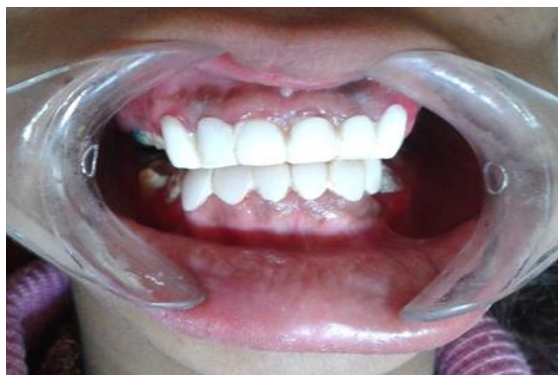
Fig. 5: Extraoral postoperative photograph after prosthetic rehabilitation