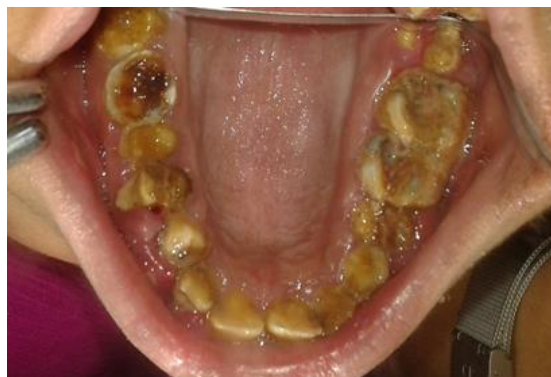
Fig. 2: Preoperative Intraoral photograph of maxillary arch