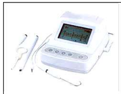
Fig. 6: E-Magic Finder

The device provides with a digital read out, graphic illustration and an audible signal. The built in pulp tester can be used to access tooth vitality. (5)