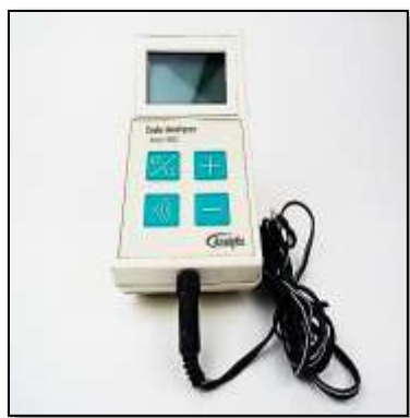
Fig. 3: Endoanalyzer

A major disadvantage of these devices was that of electro-conductive materials gives inaccurate readings. The root canal has to be free of electro-conductive materials to obtain accurate reading. (9) Also they required calibration and complicated calculations, required coated probes instead of normal endodontic instrument, no digital readout was present and it was very difficult to operate. (10) The sheath caused problems because it would not enter narrow canals, could be rubbed off and was affected by autoclaving. (1,5)