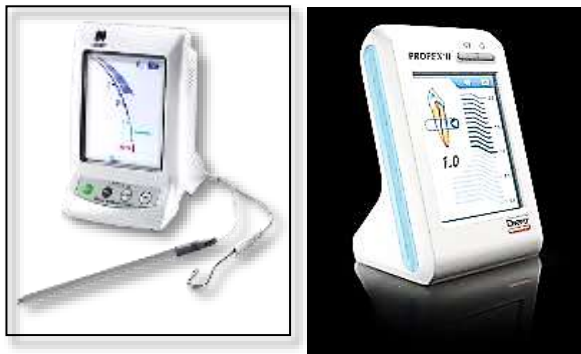
Fig. 5: a) Root ZX II, b) Propex II

Bingo 1020/Raypex (Forum Engineering technologies, Israel) claims to be a fourth generation device. This unit uses two separate frequencies 400 Hz and 8 KHz similar to the current third generation unit. (10)