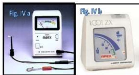
Fig. 4: a) Endex apex locator, b) Root ZX

4. Fourth Generation Electronic Apex Locators (4 th generation EALs) (Ratio Type): These are Ratio Type apex locators which determine the impedance at five frequencies and have built in electronic pulp tester. These devices not process the impedance information as a mathematical algorithm, but instead take the resistance and capacitance measurement and compare them with a database to determine the distance to the apex of the root canal.