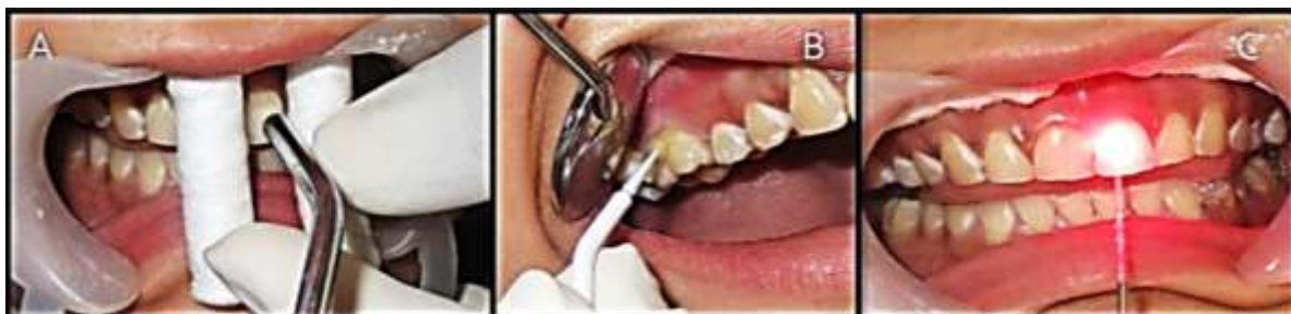
Fig. 1A: Evaporative stimulus application; B: Dentin Bonding Agent application (Group II), C: GaAlAs laser application (Group I)

Data was standardized by scoring the degree of hypersensitivity for each tooth before treatment according to the criteria proposed by Uchida et al (1980) (7) which establish four degrees for hypersensitivity depending on patient's response to stimulation (Table 1).