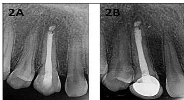
Fig. 2: (2A) Post-operative IOPAR at 1 year period. (2B) Post-operative IOPAR with Metal ceramic crown with 24 months of follow-up