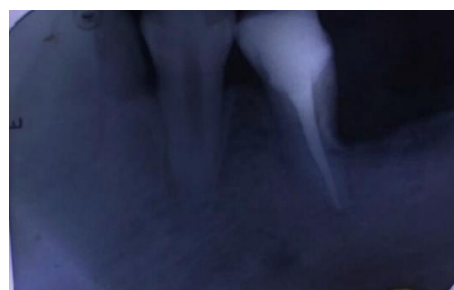
Fig. 5: Follow up radiograph