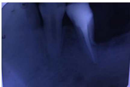
Fig. 3: Radiograph immediate after surgery

Patient was recalled after seven days for removal of sutures. Patient was recalled after 1, 3 and 6 months (Fig. 4) for follow up and radiograph was taken (Fig. 5), satisfactory healing was seen.