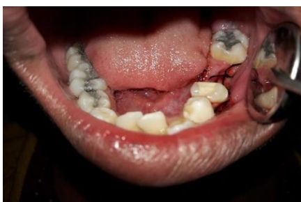
Fig. 2: Clinical picture of flap closure

The procedure was started by anaesthetizing the area of interest and triangular flap was raised by giving crevicular and releasing incision in lower left first premolar region. (35) The whole granulation tissue was removed from the site defect with curette. MTA powder was mixed with distilled water and placed in the affected area. After initial set of MTA, 4-0 abraded silk sutures was used to close the flap using direct interrupted suturing technique (Fig. 2) and intraoral radiograph was taken (Fig. 3). Postoperative instructions were given to the patient.