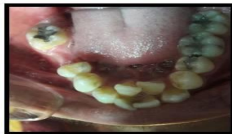
Fig. 4: Follow up clinical picture

Patient was recalled after seven days for removal of sutures. Patient was recalled after 1, 3 and 6 months (Fig. 4) for follow up and radiograph was taken (Fig. 5), satisfactory healing was seen.