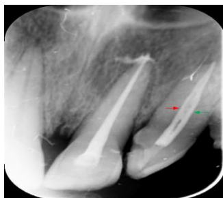
Fig. 1(c): Post-obturation periapical radiograph