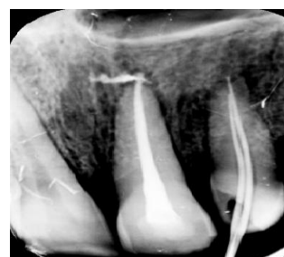
Fig. 1(b): Mastercone selection radiograph