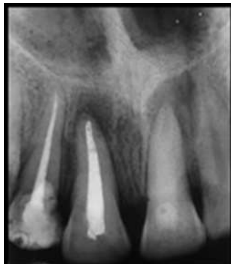
Fig. 6: Post-obturation IOPA radiograph

A post operative radiograph was taken and the access cavity was closed with Glass ionomer cement.