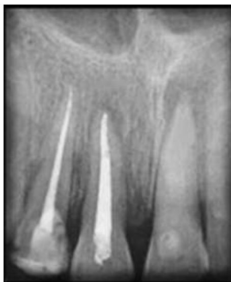
Fig. 7: After 2 months follow-up