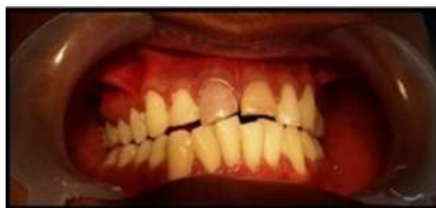
Fig. 8: Clinical follow-up After 2 months follow-up