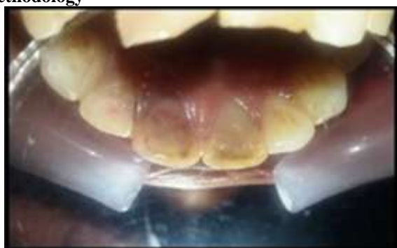
Fig. 3: Pre-operative intra-oral picture