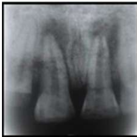
Fig 2: Pre-operative IOPA radiograph