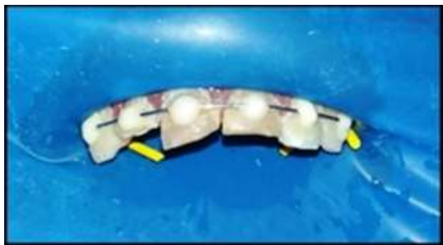
Fig. 5: Splinting done from canine to canine region under rubber-dam isolation

Access cavity preparation was done in 11 and 12 under rubber-dam isolation. Working length was determined with the help of apex-locator and was confirmed by intra-oral periapical radiograph.