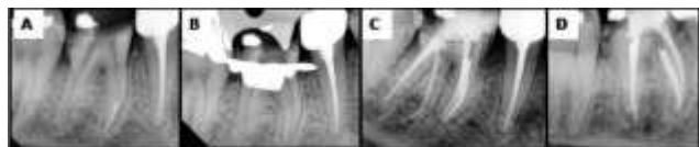
Fig. 1: Intraoral radiographs: (A) Preoperative; (B) After instrument retrieval; (C) Postoperative; (D) Postoperative at different angulation.

irrigation was done with 5 % sodium hypochlorite and 17 % EDTA. Obturation was done by warm vertical compaction and sealapex sealer (Fig. 1C & D).